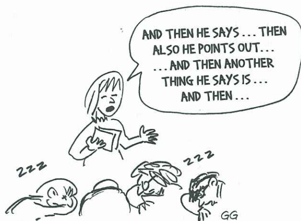
THE EFFECT OF A TYPICAL LIST SUMMARY