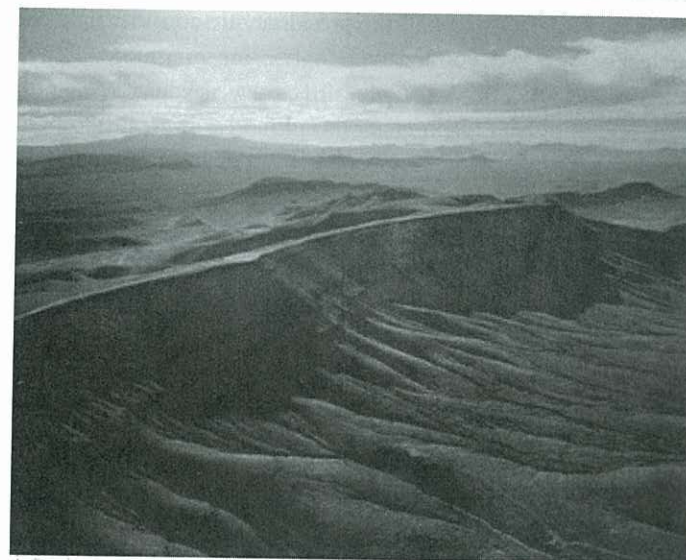
Figure 1. Yucca Mountain, Nevada, the site of the prototype nuclear waste storage facility.

To make matters worse, the Yucca Mountain region is seismically active. More than 600 earthquakes of magnitude 2.5 and higher have occurred within 50 miles in the last decade